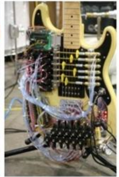
Bay Area Maker Faire